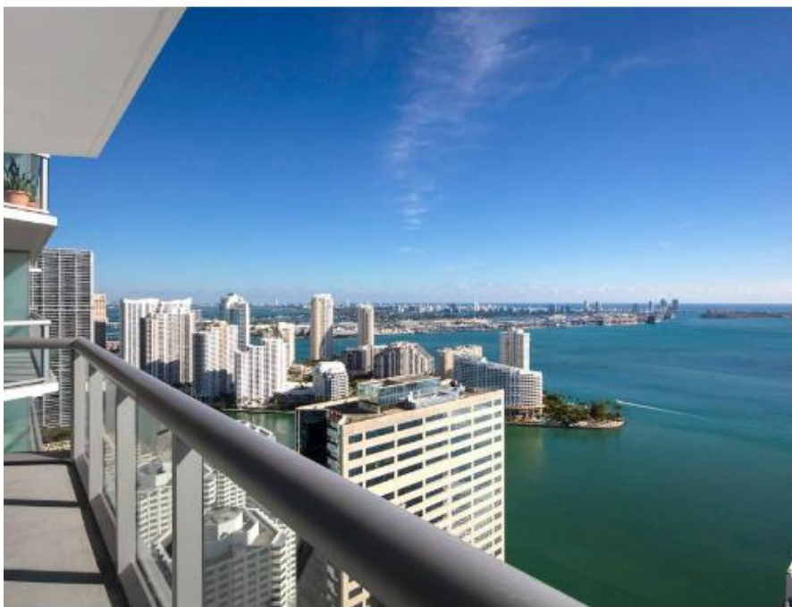
Panorama Tower Sky Deck Pool and expansive balconies offer stunning bay, sky and ocean vistas

incomparable amenity package. From the poolside sundeck to the 85th Floor penthouses, over 90% of the 821 residences have breathtaking water views, and all have spacious terraces. The building also offers residents the largest apartments, the best finishes and appliances, and the most amenities in Miami. In addition to the residential portion, the Panorama Campus features multiple components that benefit the community and attract tourism, including the 208-room Hyatt Centric Brickell Miami Hotel, 378,000 sq. ft. of high-end office space, and 75,000 square feet of upscale retail space.