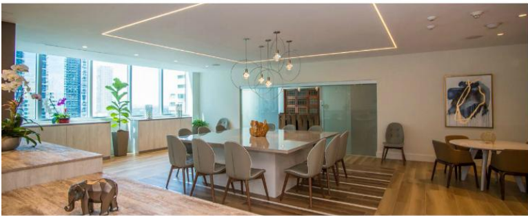
Panorama Tower Two-Story Grand Lobby; Private Dining Room. Opposite: Model Unit # Master Bedroom w/ View

Renting is appealing for everyone now – not just millennials. And the marketplace is responding with a new breed of luxury developments that are all-inclusive, secretive, convenient, carefree and offer an unsurpassed lifestyle, led by Miami's own Panorama Tower. "Millennials who are starting families and settling down, see the ease and convenience in living in a full-service building with turnkey maintenance and amenities," says Jerome Hollo, Executive Vice President of Florida East Coast Realty. "At Panorama Tower, we have a kid's playroom and splash pad on our pool deck to appeal to the families that live in our building."